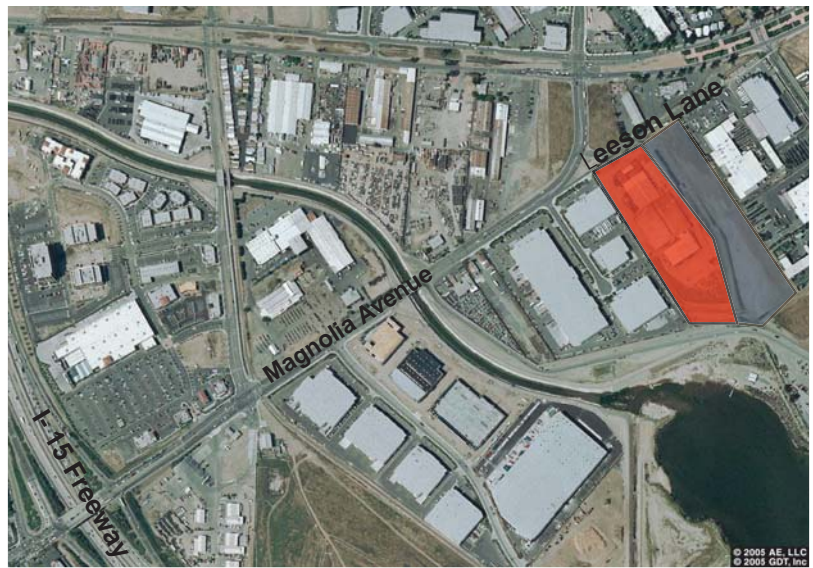
Site Available Excess Yard Area