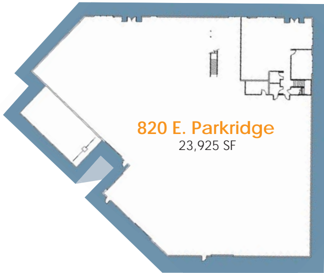
820 E. Parkridge 23,925 SF